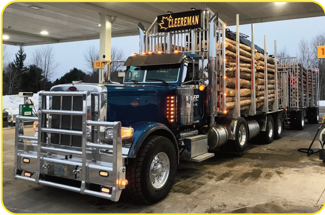
RAPTOR ® one piece bunks with extension tips