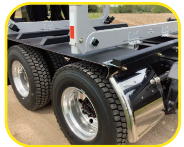
Rubber belted fenders & bolt-on fram protectors