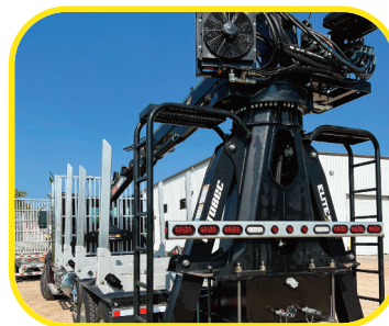
Rear view with Great Lakes Tail Bright light bar