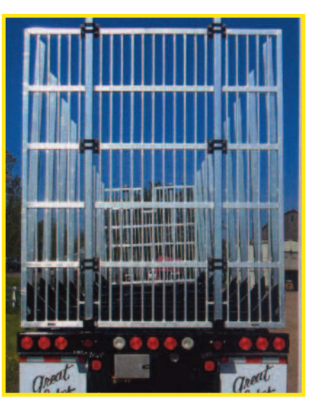
Patented All Aluminum Headboards and Adjustable Bolt-On Bracket Carrier with Wear Pads.