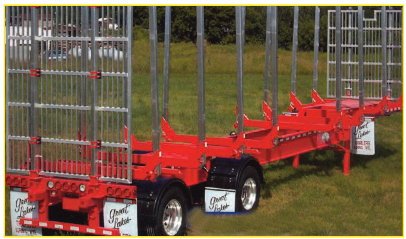
48' - 4 Tier Equipped for Center Mount Loader