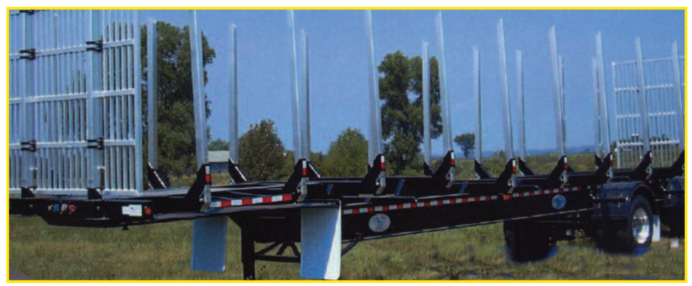
48' - 5 Tier Set Out Trailer

Engineered to carry a larger payload, our patented, gusseted steel bunks, GLT Alum-A-Log® stakes and all-aluminum head boards create a durable, lightweight trailer.