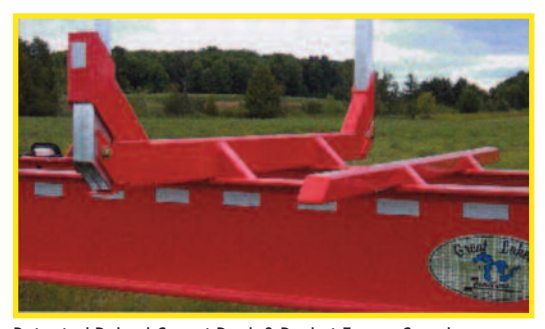
Patented Raised Gusset Bank & Bucket Frame Guard Protectors.