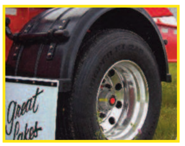
Durable Poly Contoured Fenders.