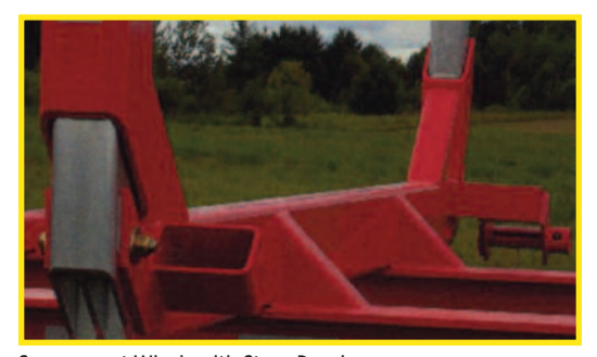
Securement Winch with Strap Receiver.